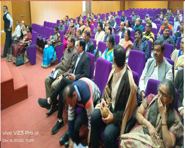
vivo V23 Pro Dec 8, 2022, 11:28