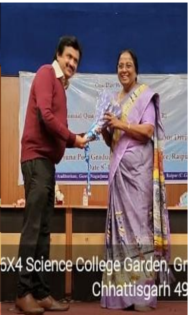
6X4 Science College Garden, Great Eastern Rd, Amanaka, Raipur, Chhattisgarh 492010, India